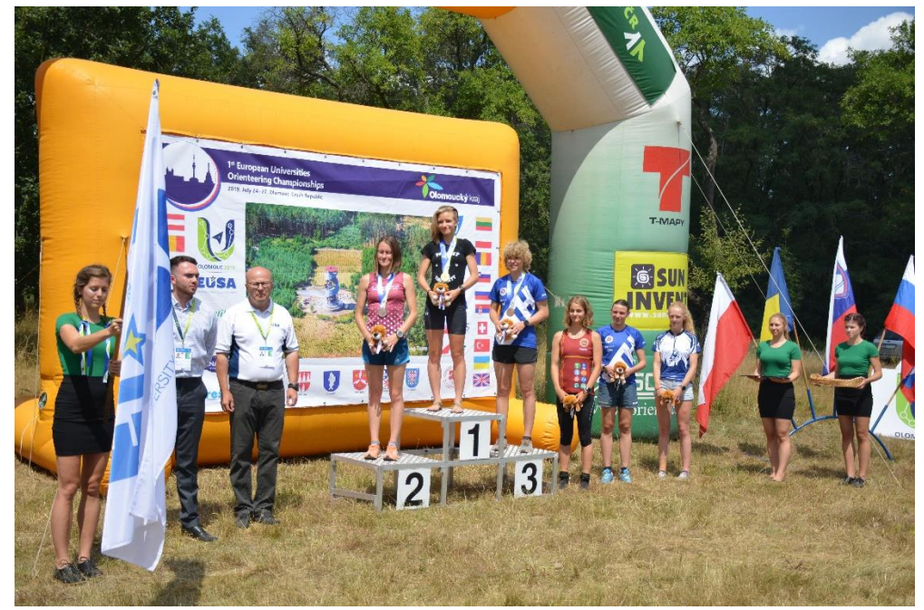
The best six women in the middle.